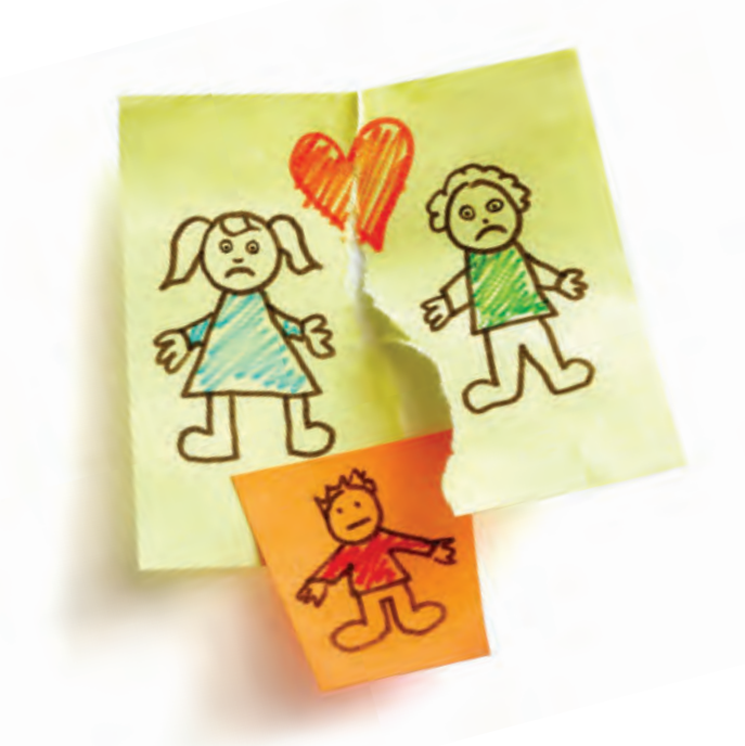
being away is too long. Their sense of time is much shorter than that of older children.